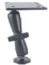
Table or wall mountable Mount for unit up to 4.5kg VESA 75 & 100 2.5" diameter base Arm length 5.625"